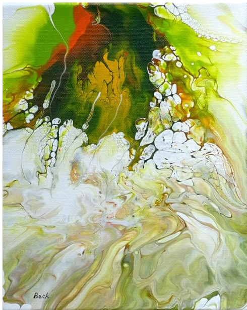
Bruce Beck - Waterfall