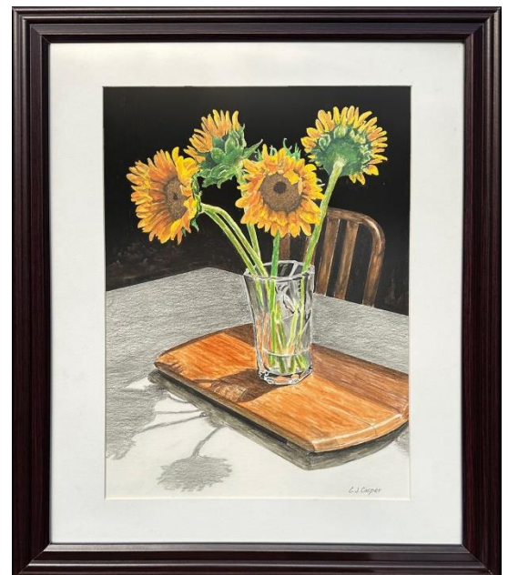
Charlie Casper – Morning Sunflowers