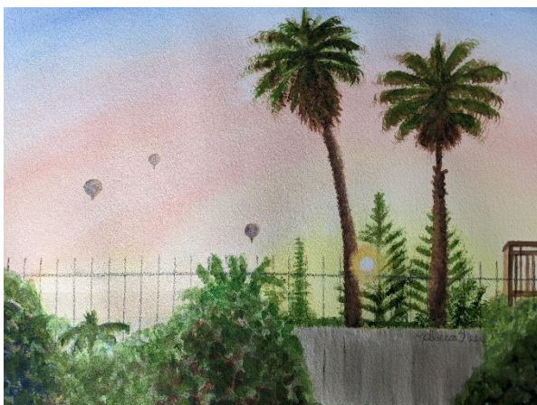
Becky Near – San Diego Sunset