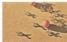
2023 1 st Place Winner "Jacks" Colored Pencil By Carla Stoltzfus