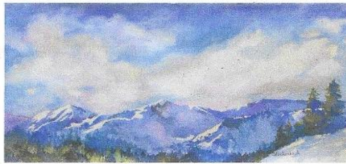
Sapphire Morning - Diane Fechenbach - Watercolor