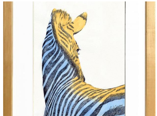
Honorable Mention – Charlie Casper Zebra Black Digital