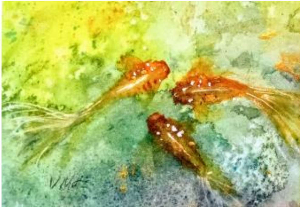
CWS Award Sparkling Water Vicki Metz